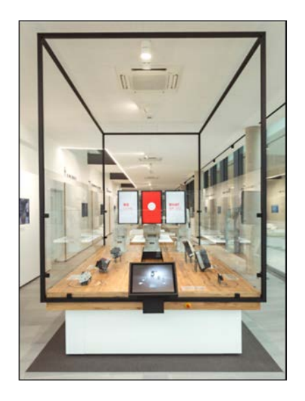
Mitsubishi Electric's interactive robot application "Threebots" receives the coveted Cannes Lion!